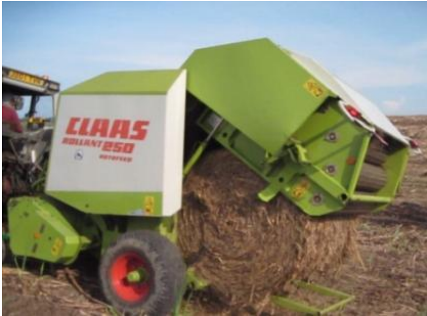
ROUND BALER (USED) PHP 987,679*