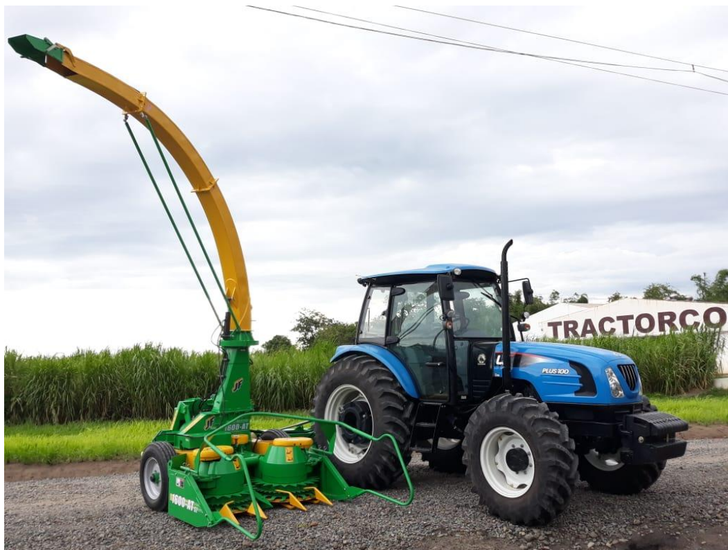
ROW INDEPENDENT PRECISION FORAGE HARVESTER FOR CORN AND NAPIER JF 1600 AT FROM PHP 2,440,867*