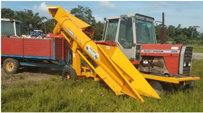
COMBINE 800 WHOLE COB CORN HARVESTER PHP 1,546,512*