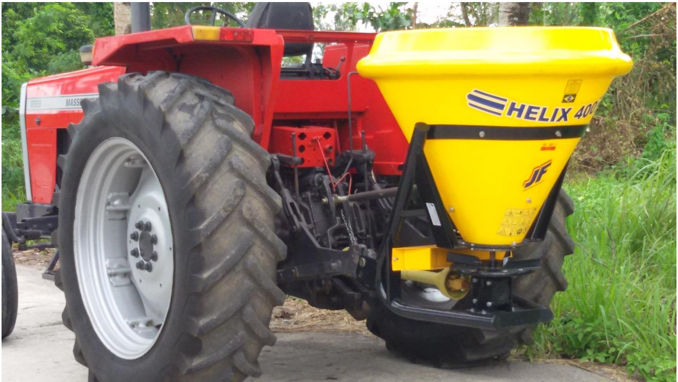
JF HELIX FERTILIZER SPREADER