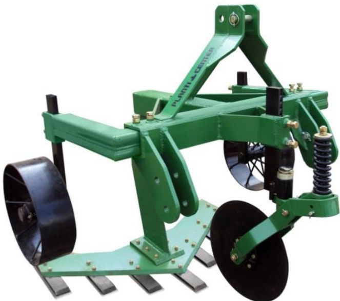
CASSAVA PLANTER DOUBLE ROW PHP 595,496*