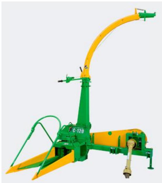
JF C120 PRECISION FORAGE HARVESTER (BELT) FROM PHP 903,243*