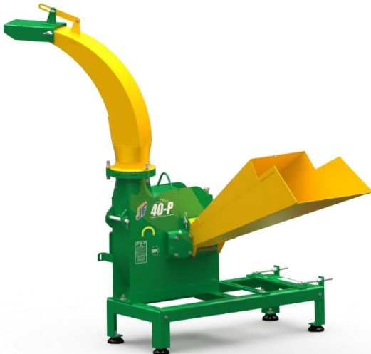
JF 40P FORAGE CHOPPERS WITHOUT MOTOR PHP 113,322*