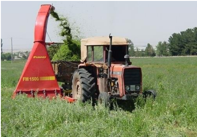
RF132 SINGLE CHOP FORAGE HARVESTER PHP 528,280.50*