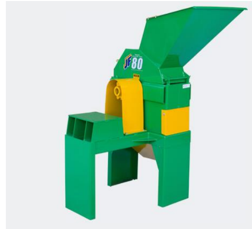
JF 80 Hammer Mill without motor with base for electric motor SIEVES NOT INCLUDED PHP 354,409*