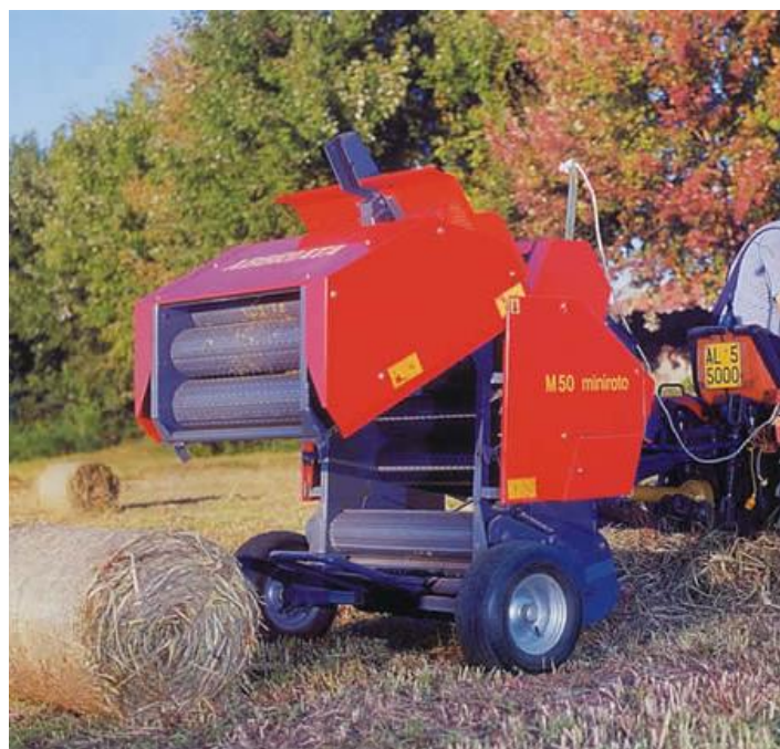
M50 MINIROTO ROUND BALER FROM PHP 505,505*