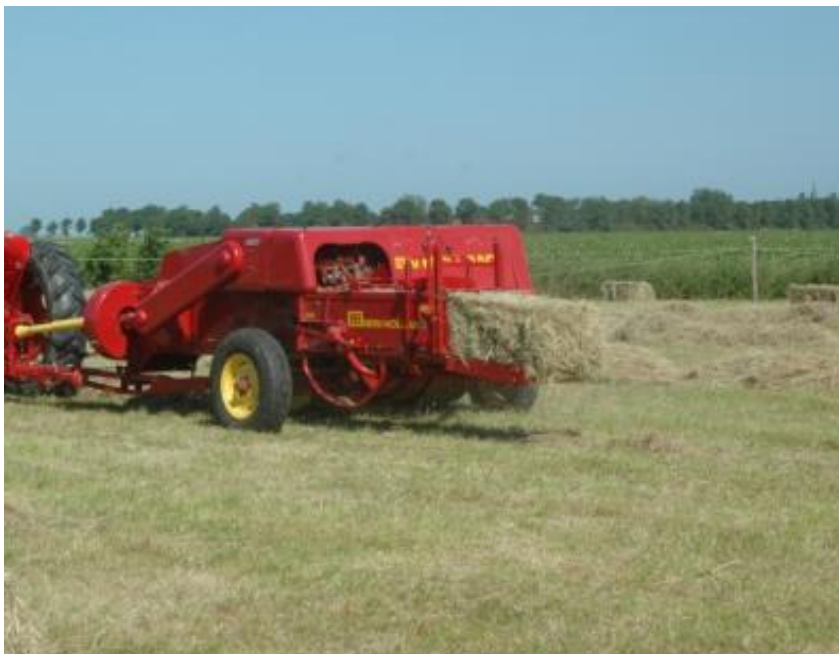
SQUARE BALER (USED) PHP729,927*

*VAT is not included in the prices stated and subject to change anytime without notice. All prices stated here are ex-works Talisay City Negros Occidental.