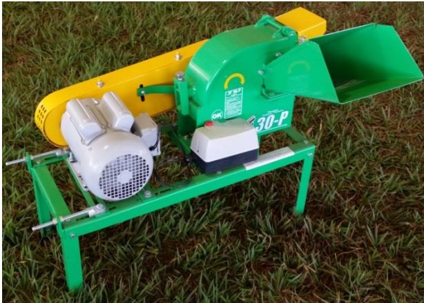
JF 30P FORAGE CHOPPERS with motor PHP 107,767