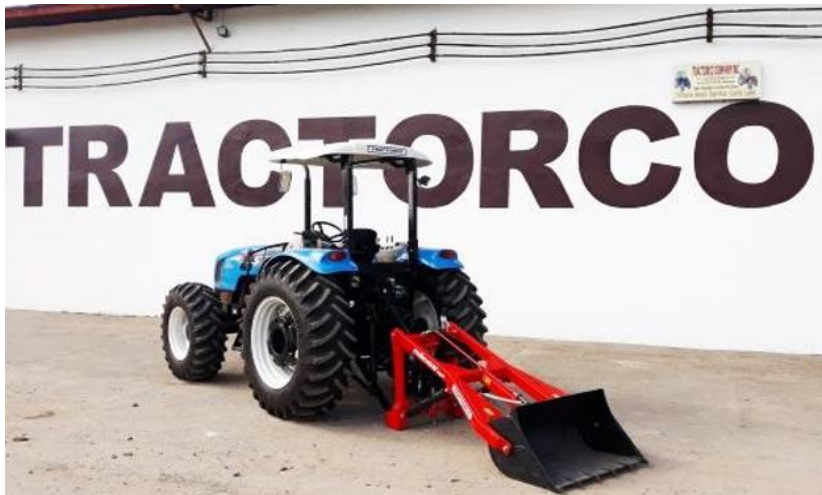
MINOS BACK LOADER TWO LIFTING ARMS