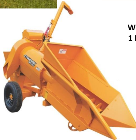
COMBINE 360G WHOLE GRAIN CORN HARVESTERS-1 ROW PHP 1,538,735*