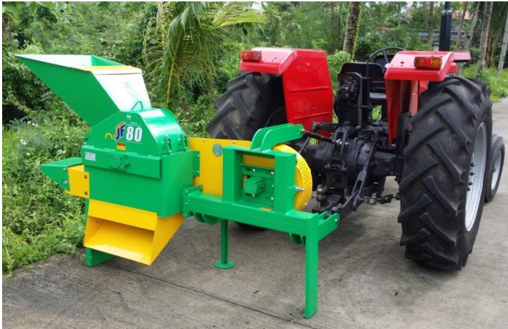
JF 80 Hammer Mill with 3-Point Linkage PTO Driven SIEVES NOT INCLUDED PHP 471,064*