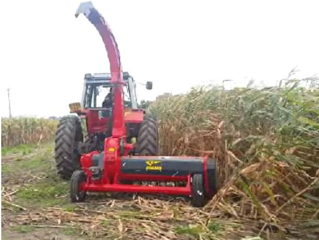
FIMAKS DOUBLE CHOP FORAGE HARVESTER FROM PHP 861,025.00*