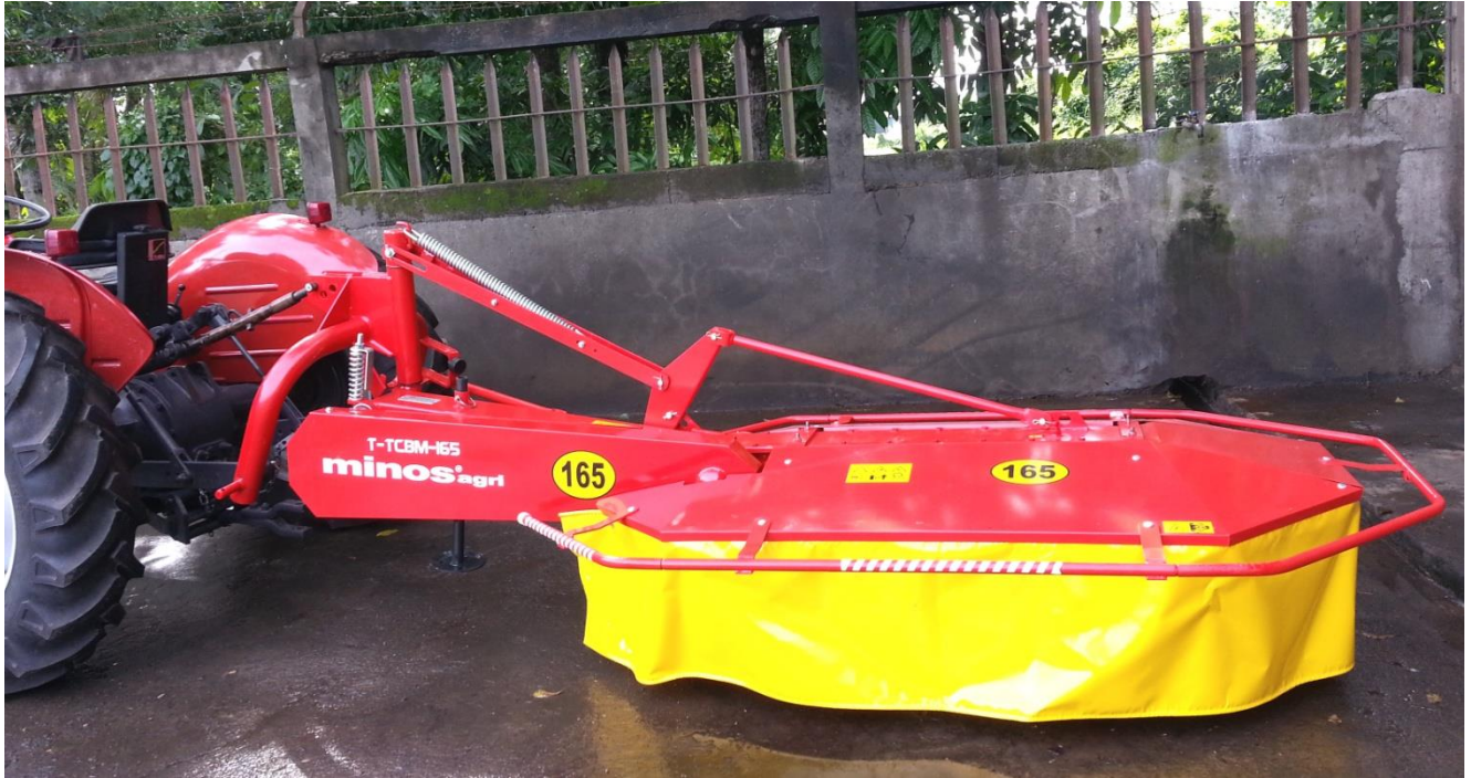
MINOS AGRI ROTARY DRUM MOWER FROM PHP 404,404*