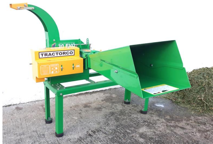
JF 30VO FORAGE CHOPPER WITHOUT MOTOR PHP 117,160*