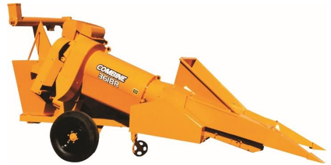
COMBINE 361BR WHOLE GRAIN CORN HARVESTER 1 ROW WITH ADVANCED FRONT FEEDER UNIT PHP 1,757,602*