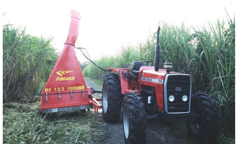
RF152 SINGLE CHOP FORAGE HARVESTER PHP 555,500*