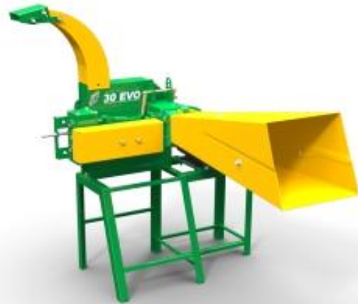
JF 30 EVO FORAGE CHOPPERS with motor PHP 142,208*