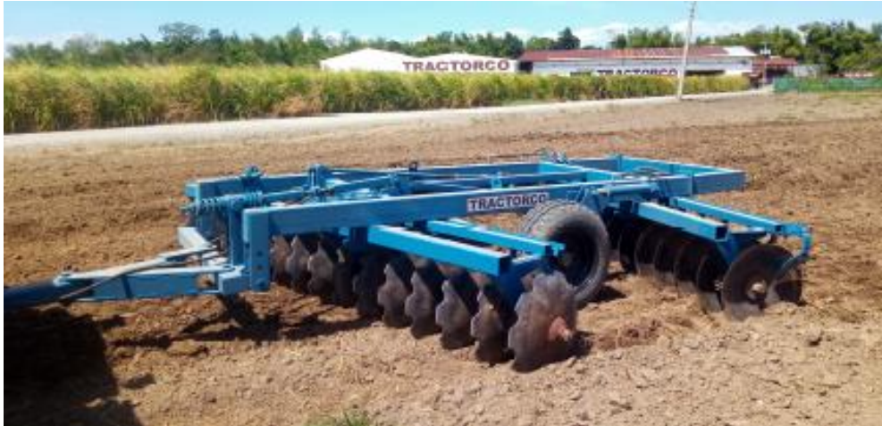
HEAVY DUTY BRITISH MADE DISC HARROW