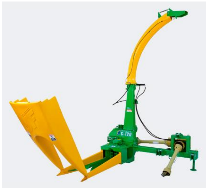
JF C120 PRECISION FORAGE HARVESTER (Gearbox) FROM PHP 958,793*