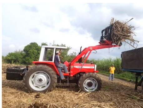
FRONT GRABBERS TO FIT ON 4WD MASSEY FERGUSON AND FORD TRACTORS