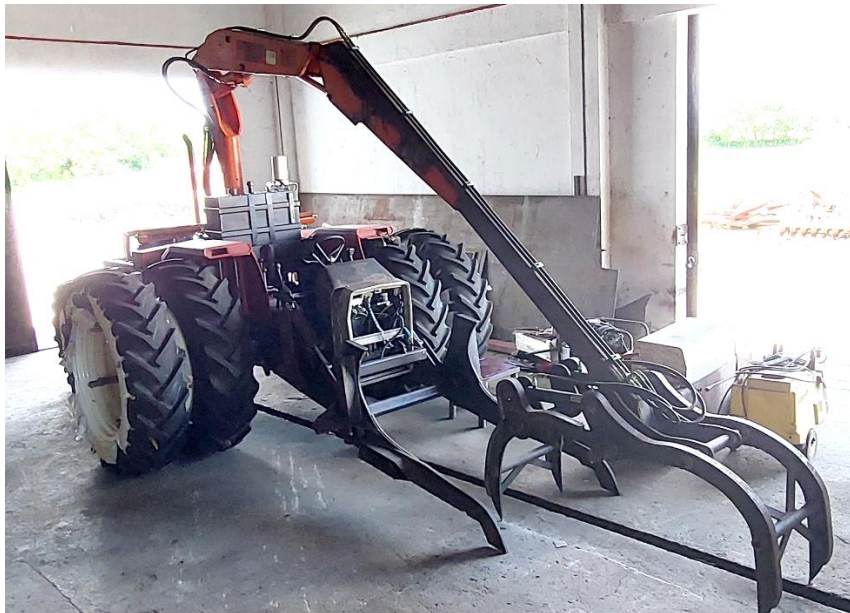
This unit is about to finish and ready for sale!