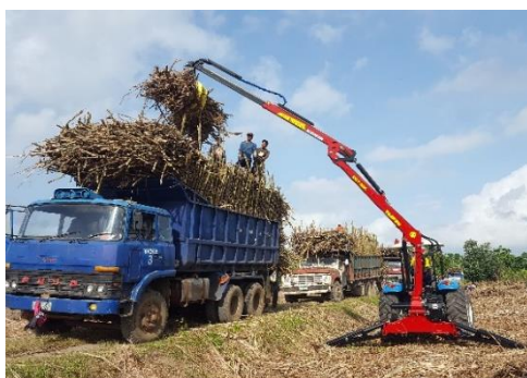
7.1M REACH CANE LOADER